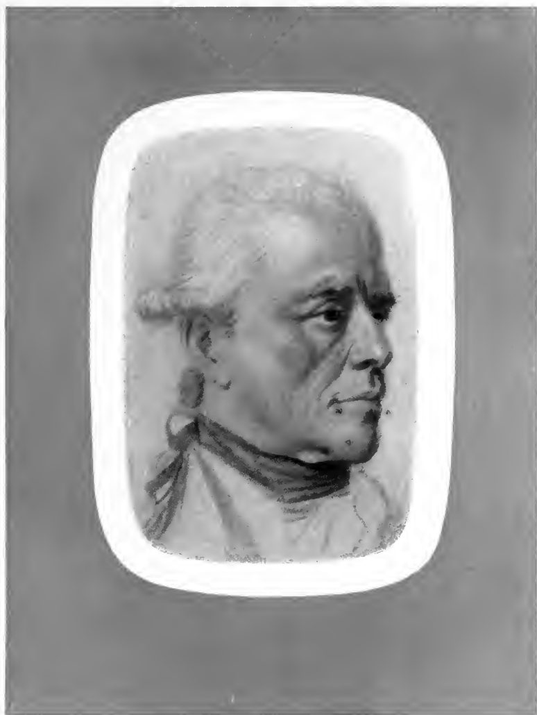
PRINCE FRANZ W. HOHENLOHE BY HEINRICH FRIEDRICH FÜGER